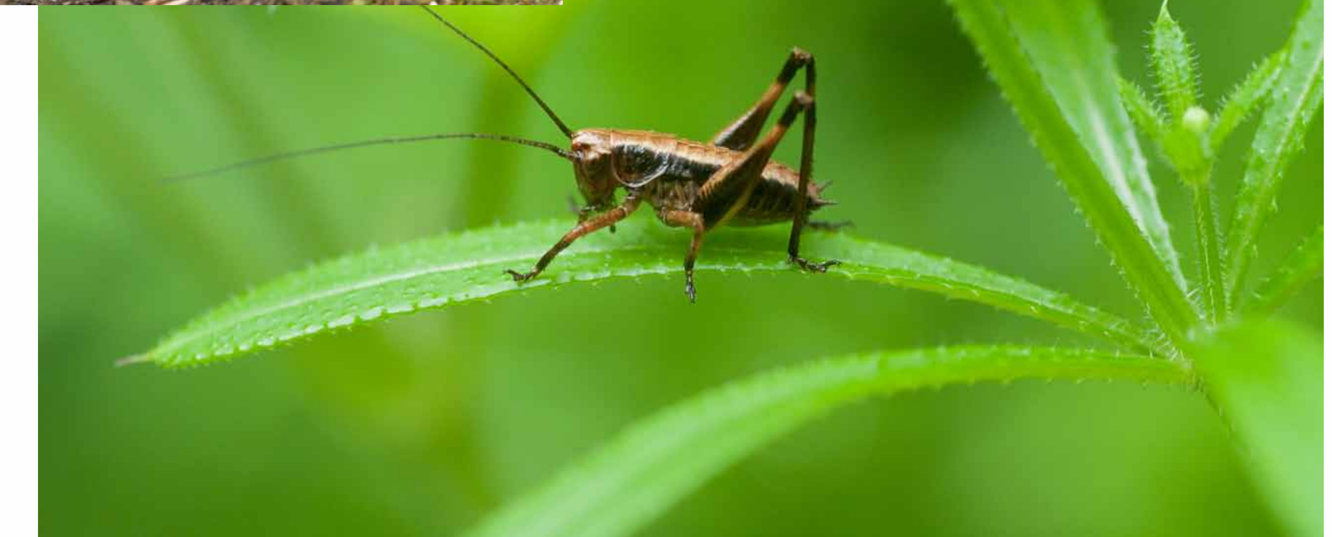
Above: Dark bush cricket