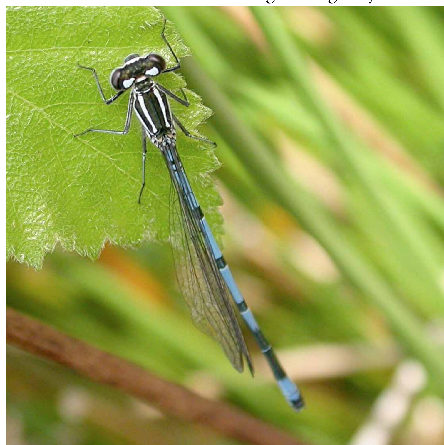
Above: Azure Damselfly