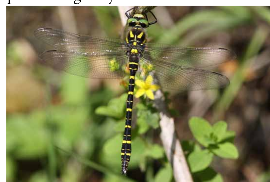
Above: Golden Ringed Dragonfly