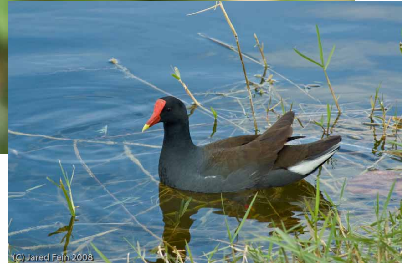
Above Coot, (Moorhens have a white upper beak).