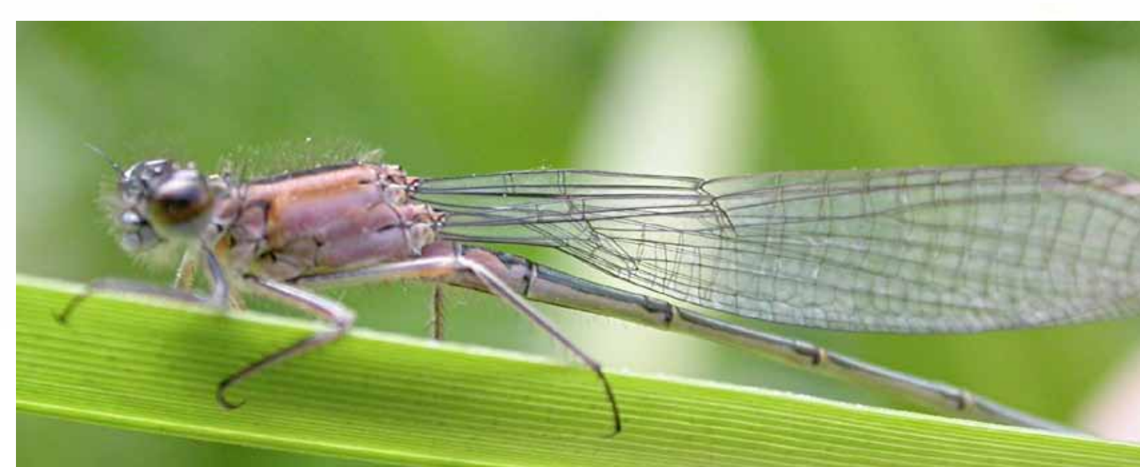
Above: Female common blue Damselfly