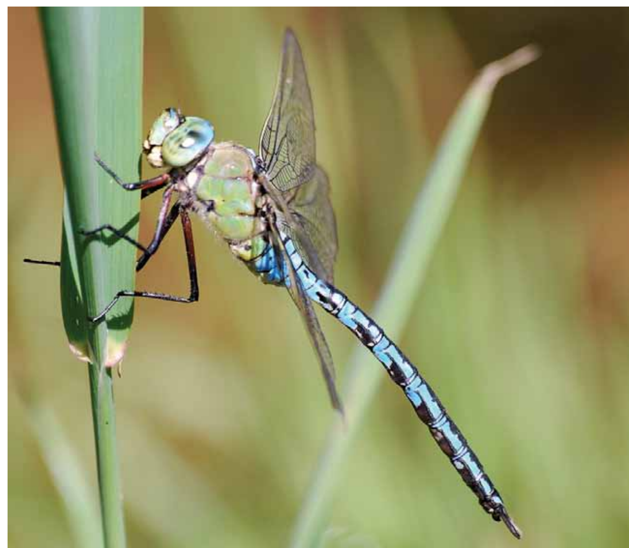
Above: Emperor Dragonfly

Created in 1999, Lower Bruckland is a private nature reserve that is open to visitors between Spring and Autumn. Ongoing projects include English woodland creation, water vole recovery, butterfly conservation and wildflower introduction. During the summer months the area abounds with many dragonfly species. This tranquil space provides lovely walks amongst the lakes and young woodlands.